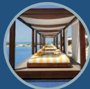
Furnishing Outdoor Furnishing